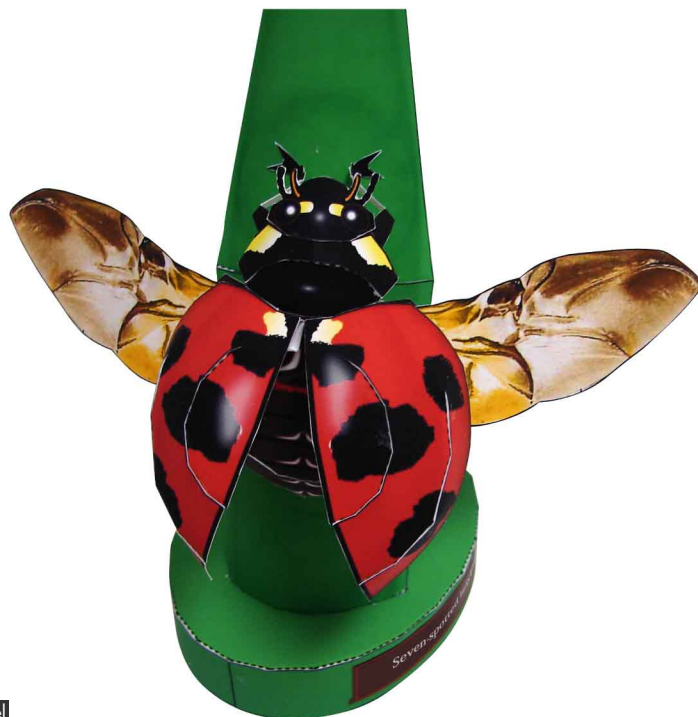
View of completed model